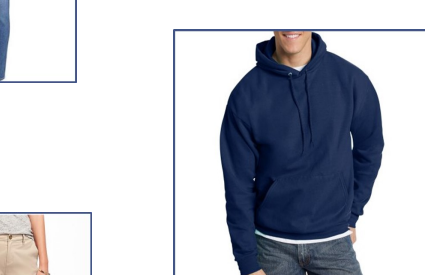
Other Clothing Items or Accessories: